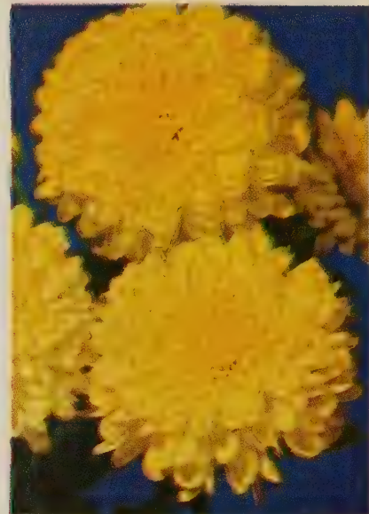
GOLDEN HOURS. 50c each; 3 for $1.25